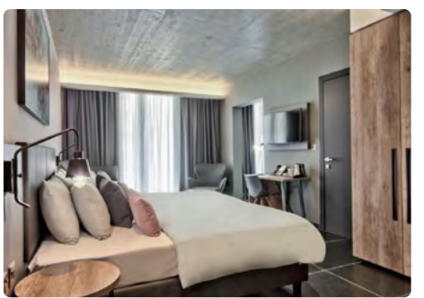
Number 11 Hotel