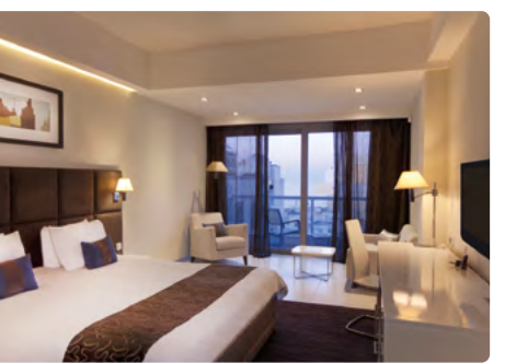
The George Hotel