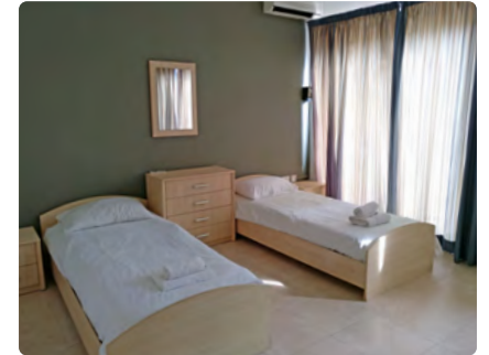
Valley View Apartments