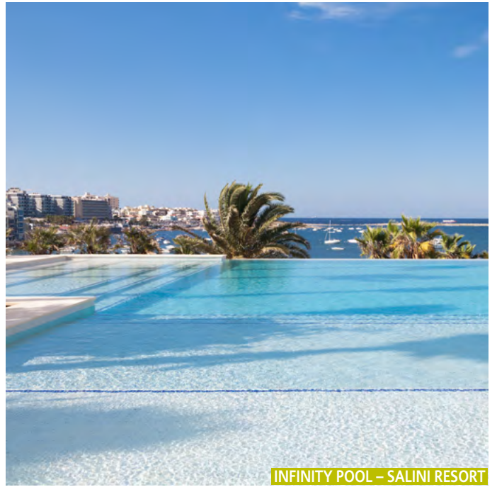
INFINITY POOL – SALINI RESORT