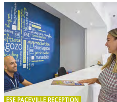
ESE PACEVILLE RECEPTION