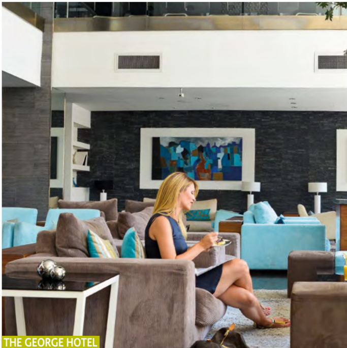
THE GEORGE HOTEL