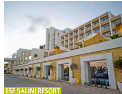
ESE SALINI RESORT