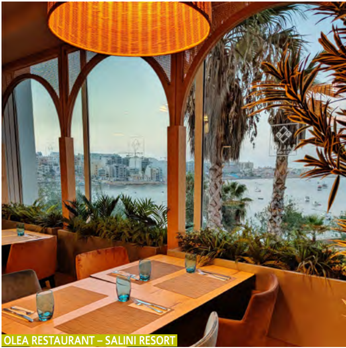
OLEA RESTAURANT – SALINI RESORT