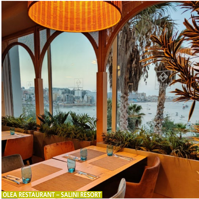
OLEA RESTAURANT – SALINI RESORT