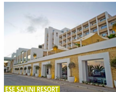
ESE SALINI RESORT