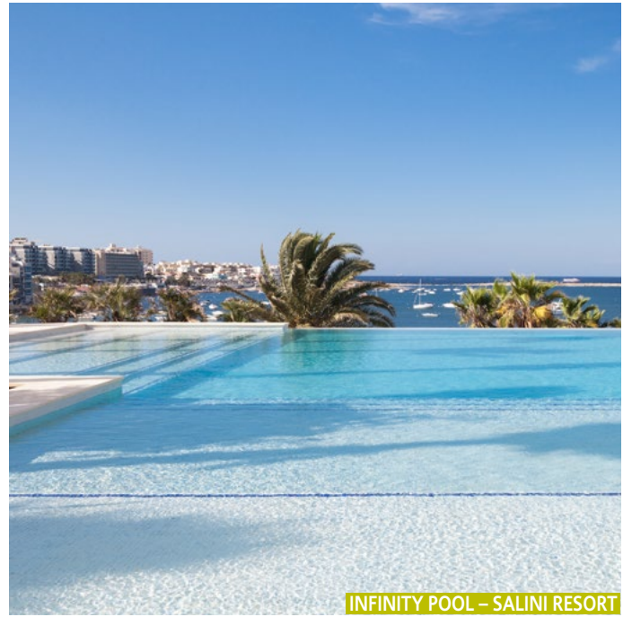
INFINITY POOL – SALINI RESORT