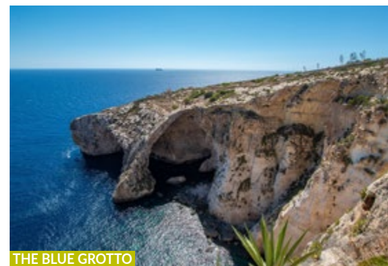
THE BLUE GROTTO