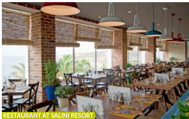
RESTAURANT AT SALINI RESORT