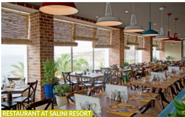
RESTAURANT AT SALINI RESORT