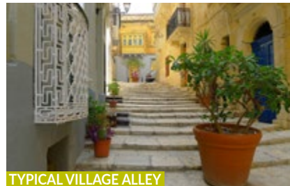
TYPICAL VILLAGE ALLEY