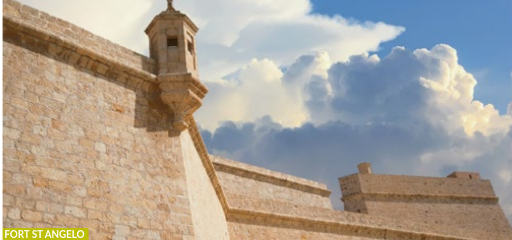
FORT ST ANGELO