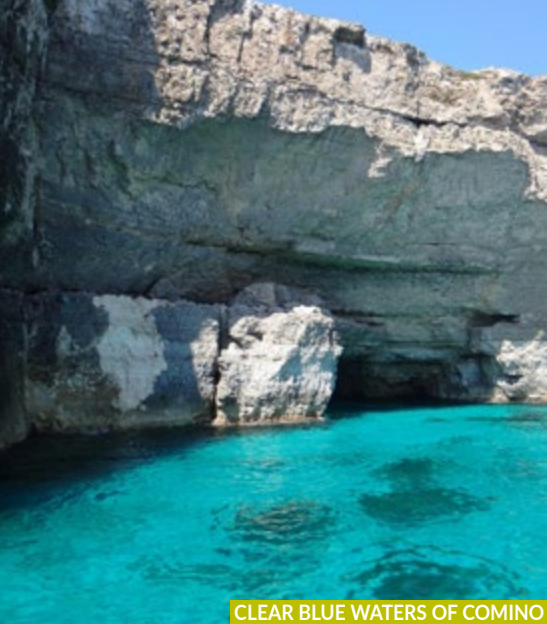
CLEAR BLUE WATERS OF COMINO