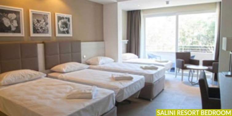
SALINI RESORT BEDROOM