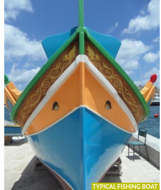
TYPICAL FISHING BOAT

Both sandy and rocky beaches can be found all over the island – Paradise Bay, Blue Lagoon (Comino), St Peter's Pool, Mellieha Bay, Golden Bay... just to mention a few! Dive into the crystal clear waters and have a swim or two! The water is warmest between May and October.